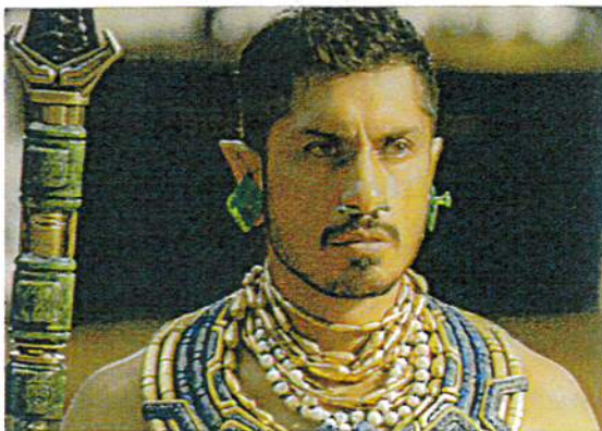
Iron Heart played by Tenoch Huerta who stated in an interview with NBC: "...diversity matters. This movie shows Black and Indigenous characters from East Africa and Mesoamerica."