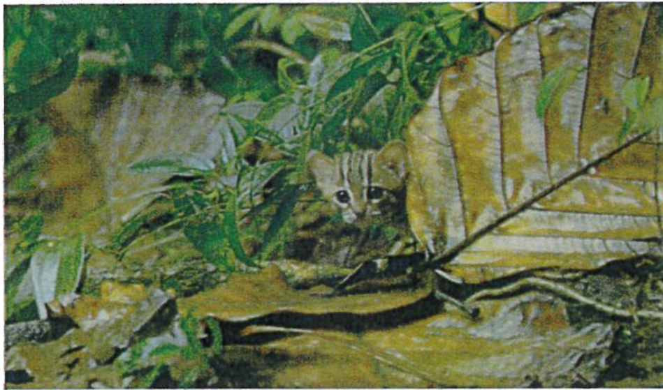
Rusty-spotted cat compared to a leaf

The rusty-spotted cat, whose scientific name is the Prionailurus rubiginosus , is the world's smallest cat. This feline lives in the grasslands, scrubs, and forests of India and Sri Lanka. This cat can grow up to 35-48 centimeters or 13-19 inches and weigh between 0.9 and 1.6 kilograms or 1.9 and 3.5 pounds. That certainly is smaller than the average American house cat.