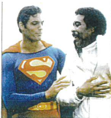
Christopher Reeve as the original Superman and comedic genius, Richard Pryor, as Gus Gorman

The other plot line of this movie is about Gus Gorman, played by comedian Richard Pryor. He worked for a financial company when he is caught hacking and is fired from his day job. This, however, catches the attention of Ross Webster who hires him to take control of satellites and weaponize them to take out coffee supplies in Columbia. Superman soon finds out, breaks through his inner battle, and stops Ross and Gus before they can destroy Columbia. This is a plot that knows it is half silly. It takes the comedic skills of Richard Pryor, adds a funny script, and makes a very light and fun film with a solid story line and decent cast. In the end, I would give this movie 4.2 out of 5 large pop-