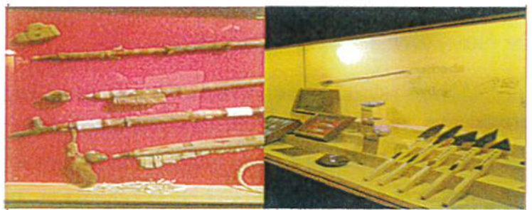
Peace Pipes and Arrowheads on display At the Pocono Indian Museum

The Pocono Indian Museum displays Native American artifacts from around 150 years ago. It also teaches the history of the Delaware Indians. The place was established in 1976 and is usually open to the public from 10 AM to 5:30 PM. The tour is estimated to be 30 minutes long.