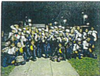
PMWHS marching band posing for a quick pic!