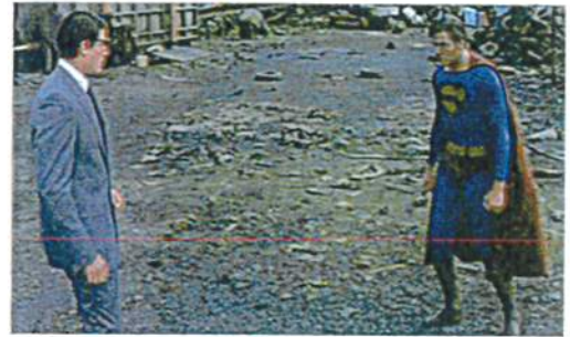
Clark Kent's brief battle with Superman

A few of the reasons I feel that this movie deserves more attention than it receives is because it attacks a plot line never tried before. One of the main plot lines is that Superman is confronted with "Synthetic Kryptonite." This causes him to have two personalities battle inside of his mind, resulting in mood changes and involuntary actions. This is where possibly the most creative and unusual scene I have ever seen comes into play. While not himself, Superman flies to the Leaning Tower of Pisa and just straightens it. This goes to show how truly creative this movie was. And possibly the most entertaining fight I have ever seen on the TV screen is when Superman battles with Clark Kent, his alter ego.