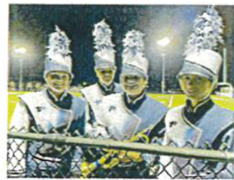
The best of friends