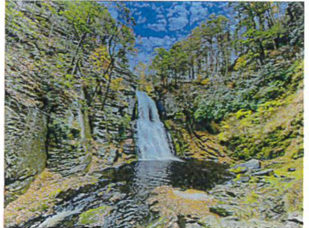
Bushkill Fall, the "Niagra of Pennsylvania"

This beautiful place is Bushkill Falls , Around 33 miles away or about 50 minutes from Pocono Summit, it is worth the travel. Many tourists go there to enjoy the scenery, camp, swim, fish, hike, and most importantly, have fun. To get there, one must hike and go across bridges to see the wonderful eight waterfalls.