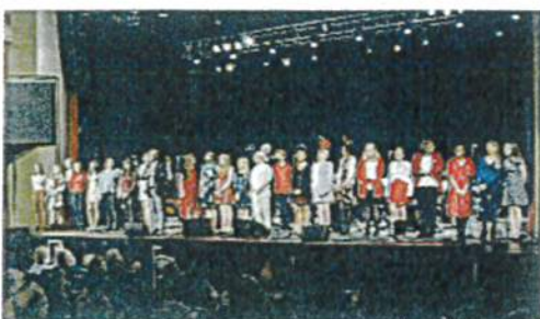
Stunning performance that brought down the house with standing ovations