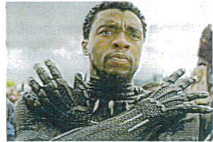
Chadwick Boseman starring as the Black Panther

This film starts off with a tribute to T'Challa, but really it was a tribute to Chadwick Boseman just as well. His heart-breaking death left people all over the world questioning who would take over the mantle of Black Panther, and could Black Panther ;Wakanda Forever live up to the first movie? And I'm glad to