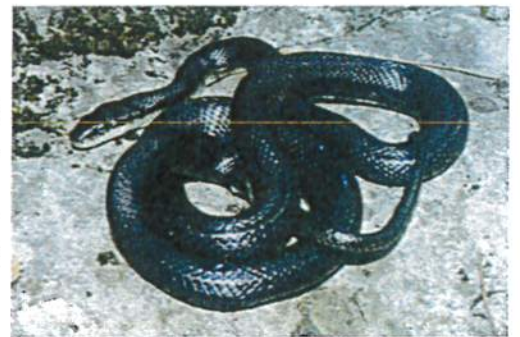
Black Rat Snake

As of today, the longest snake in PA is the Black Rat Snake. The longest Rat Snake recorded was over 8 feet long! These snakes can vary from dark brown to pure black, as suggested by the name. The Black Rat Snake is a constrictor, meaning it will wrap around and suffocate its victim. One interesting thing about the Rat Snake is that despite their size, they can hide in trees. Another interesting thing is that if these snakes are threatened, they will vibrate their tail in order to imitate a rattlesnake. This deception is a form of Batesian mimicry, when a non-venomous animal mimics a venomous one in order to avoid getting eaten by predators.