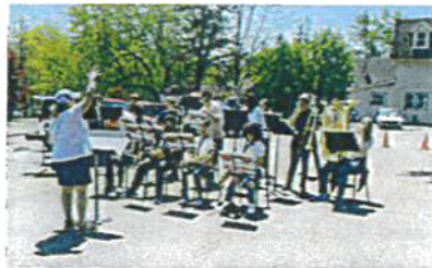
Jazz band hitting those jazzy notes!